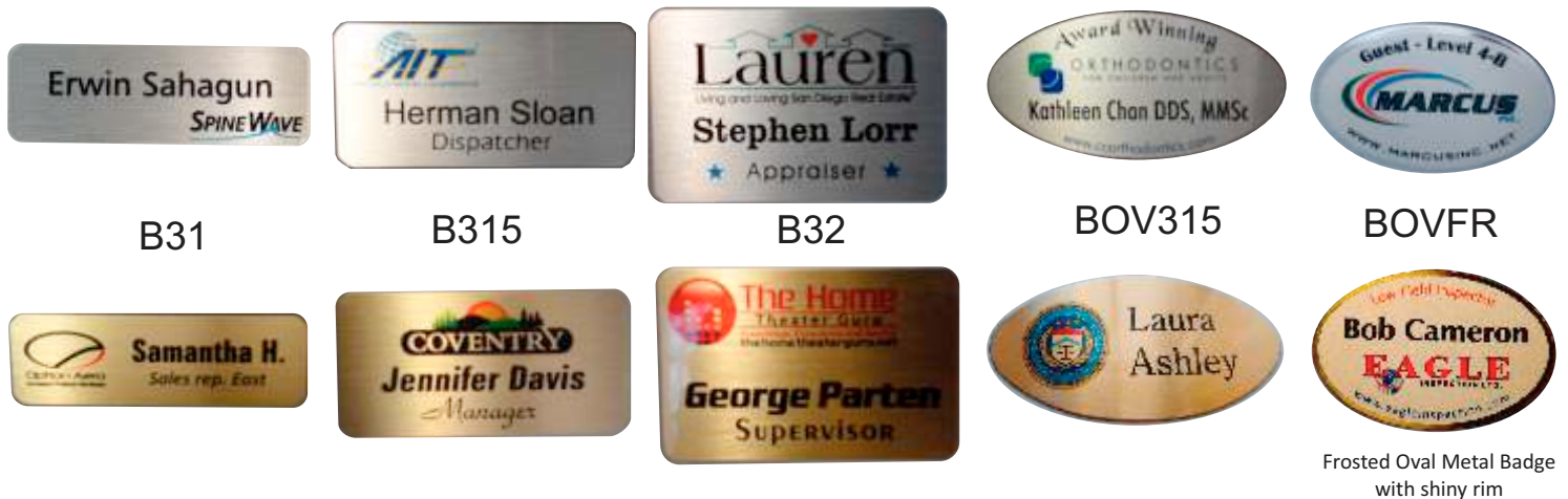
Frosted Oval Metal Badge with shiny rim

Executive Badges with Full Color Logo & Magnet Included